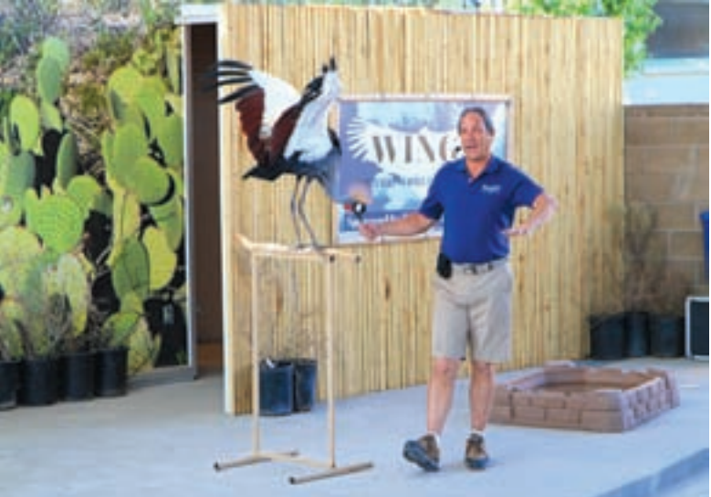
Aviary at El Paso Zoo, Texas