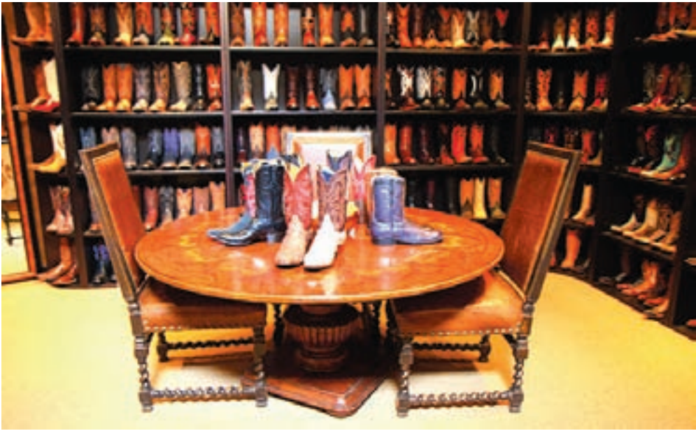
Lucchese Boots - El Paso, Texas