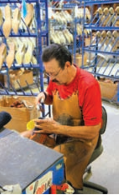
Lucchese Craftman forming leather over boot sole

El Paso's restaurants offer local flavor profiles that are especially appealing and tasty Texas beef is the chief component. Legendary Cattleman's Steakhouse at Indian