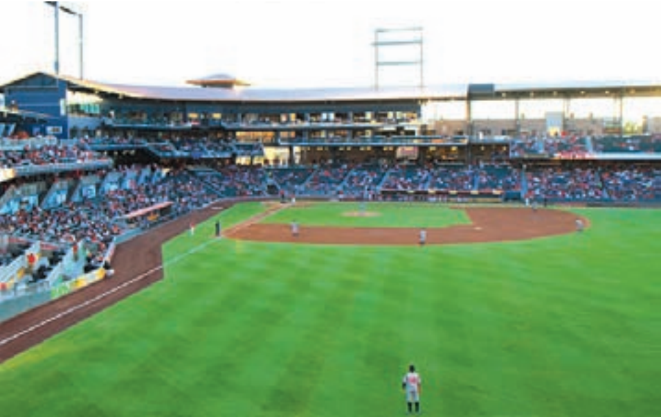
Southwest University Park - El Paso, Texas