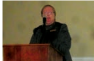
Mill Creek Mayor Pam Pruitt